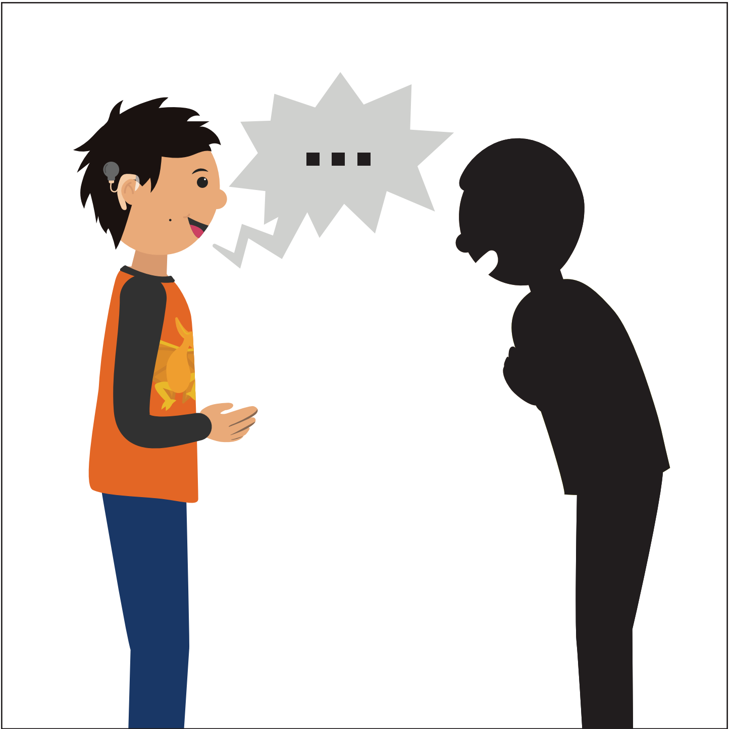
Friends laugh together. Some friends like to tell jokes or act silly!