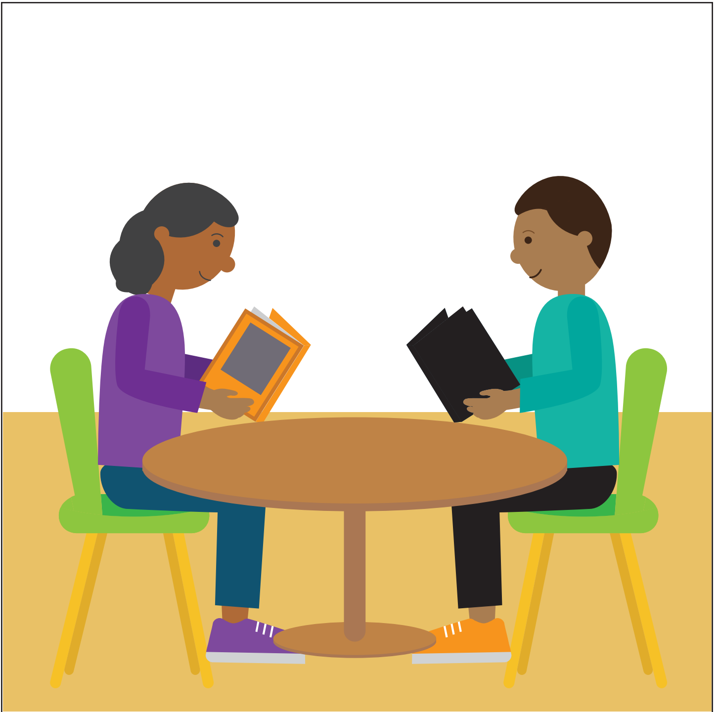
Friends read books together. These friends are reading books together at the table.