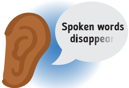
Visuals provide permanent information