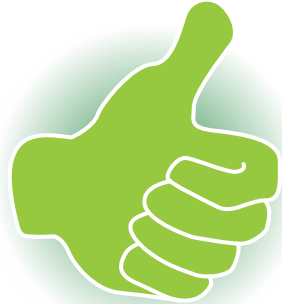
Visuals don't have an attitude