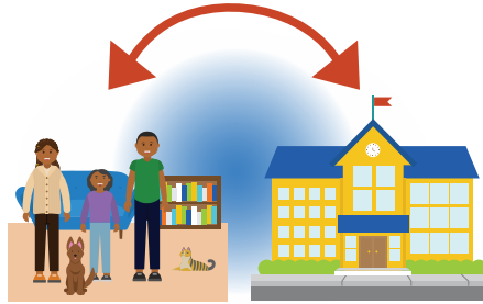
Visuals can be used across different environments and people