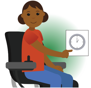
Visuals help students focus on relevant information