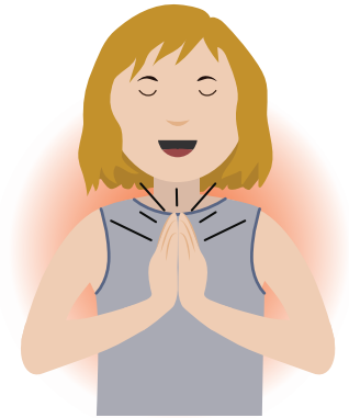
Visuals help reduce anxiety