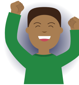
Visuals build independence