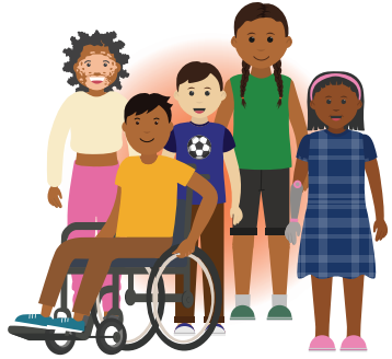
Visuals help ALL learners