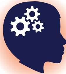
Visuals allow time for language processing