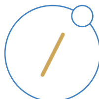
Mini Popsicle stick